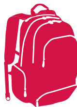
backpack, tote bag or bat bag

Please remember to provide 3-4 beverages (or enough to last the whole day).